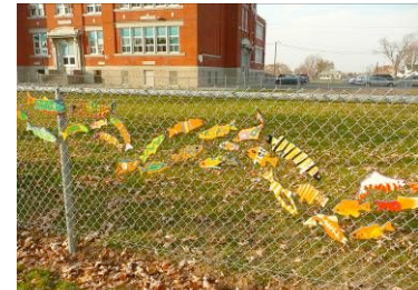
Queen Victoria School in Ontario

Queen Victoria School, one of the oldest schools in our area, was eager to be the pilot school for our first Stream of Dreams program. All 266 students, 13 teachers and all school staff, school-board officials, parent volunteers, and local area high schools students excitedly took part in the preparation, program delivery and installation of the mural.