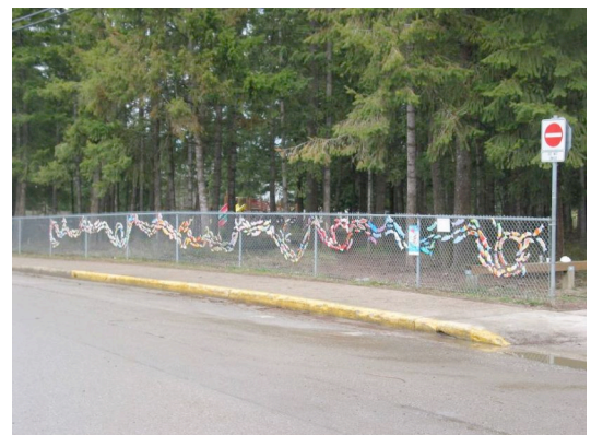
Hillcrest Stream of Dreams, Salmon Arm