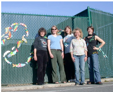
Kootenay trainees with Lower Mainland team.